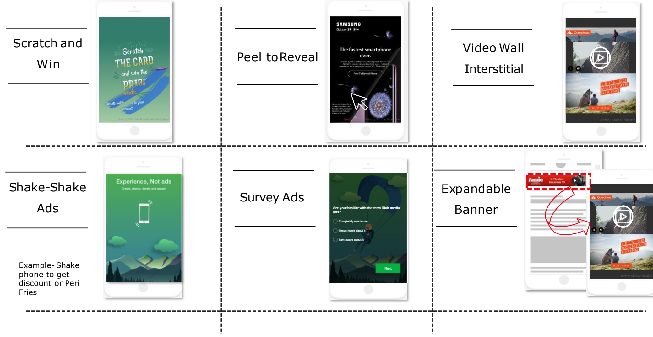
Many More ad formats. Same are available in the Desktop Format